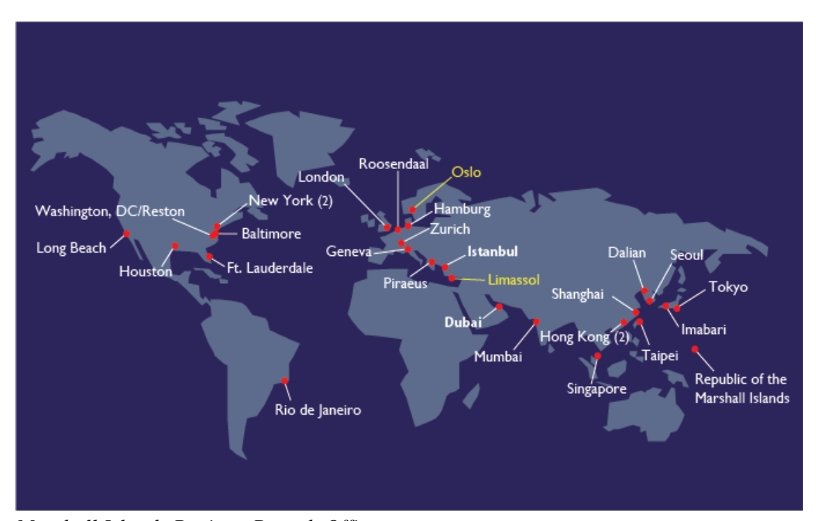
Marshall Islands Registry Branch Offices

With abundant funds and increasing ambitions to develop their business, the Marshall Islands Registry is actively expanding their footprints all over the world. They sponsor various shipping forums and functions in the major maritime hubs and financial centres to attract global attention. After the 2008 shipping crisis, for instance, the Marshall Islands Registry has speed up its pace of growth and have become even more passionate, remarkably almost half of its 27 regional offices have been set up since the year of 2008 and it seems that its efforts have paid off.